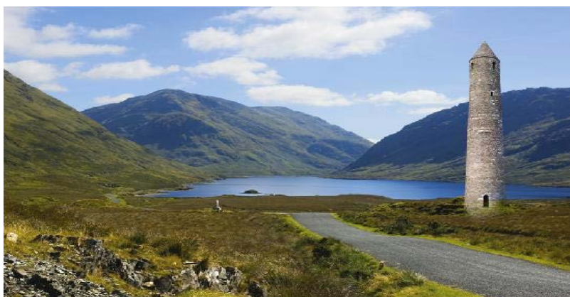
Glendalough, Co Wicklow

In addition to the extra-curricular activities we provide at the college we believe that an integral part of the student learning experience is embracing Irish culture. Students are fortunate to live in Dublin, the literary city where they can learn so much about Irish writers. Study trips to museums and other places of interest take place every Friday. In addition, teachers may bring students to various locations in the city as part of their course where appropriate. This is to be seen as an opportunity to learn within a real world example and is not intended to be a social outing. Further to the activities above, we also organise monthly excursions to different parts of the island such as Galway, the Giants Causeway, the Cliffs of Moher and Glendalough. It is our underlying goal that the above will instil a deep-rooted love of the English language and a fond memory of the island where you learnt the language.