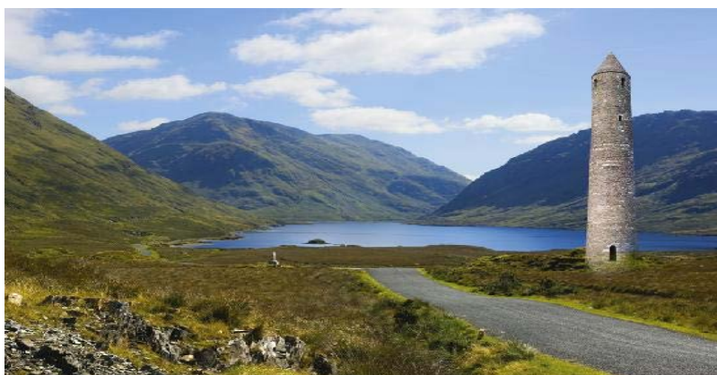
Glendalough, Co Wicklow

In addition to the extra-curricular activities we provide at the college, we believe that an integral part of the student learning experience is embracing Irish culture. Students are fortunate to live in Dublin, the literary city where they can learn so much about Irish writers. Study trips to museums and other places of interest take place every Friday. In addition, teachers may bring students to various locations in the city as part of their course where appropriate. This is to be seen as an opportunity to learn within a real world example and is not intended to be a social outing. Further to the activities above, we also organise monthly excursions to different parts of the island such as Galway, the Giants Causeway, the Cliffs of Moher and Glendalough. It is our underlying goal that the above will instil a deep-rooted love of the English language and a fond memory of the island where you learnt the language.