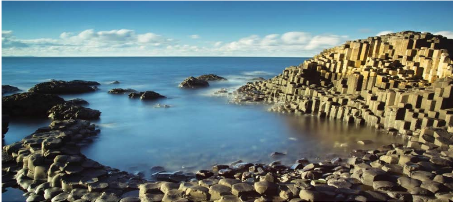
The Giant's Causeway, Co Antrim